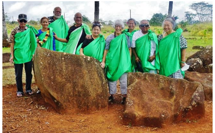
HCCW nā lālā 'ōiwi a me lālā ho'okama onsite to host our guests.