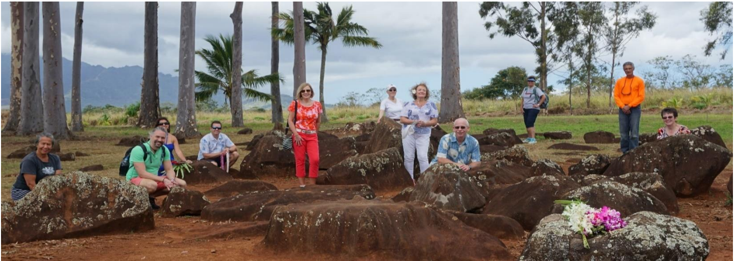
'Ōlelo No'eau...#1186 MARY KAWENA PUKUI...I ka nānā no a 'ike. By observing, one learns.